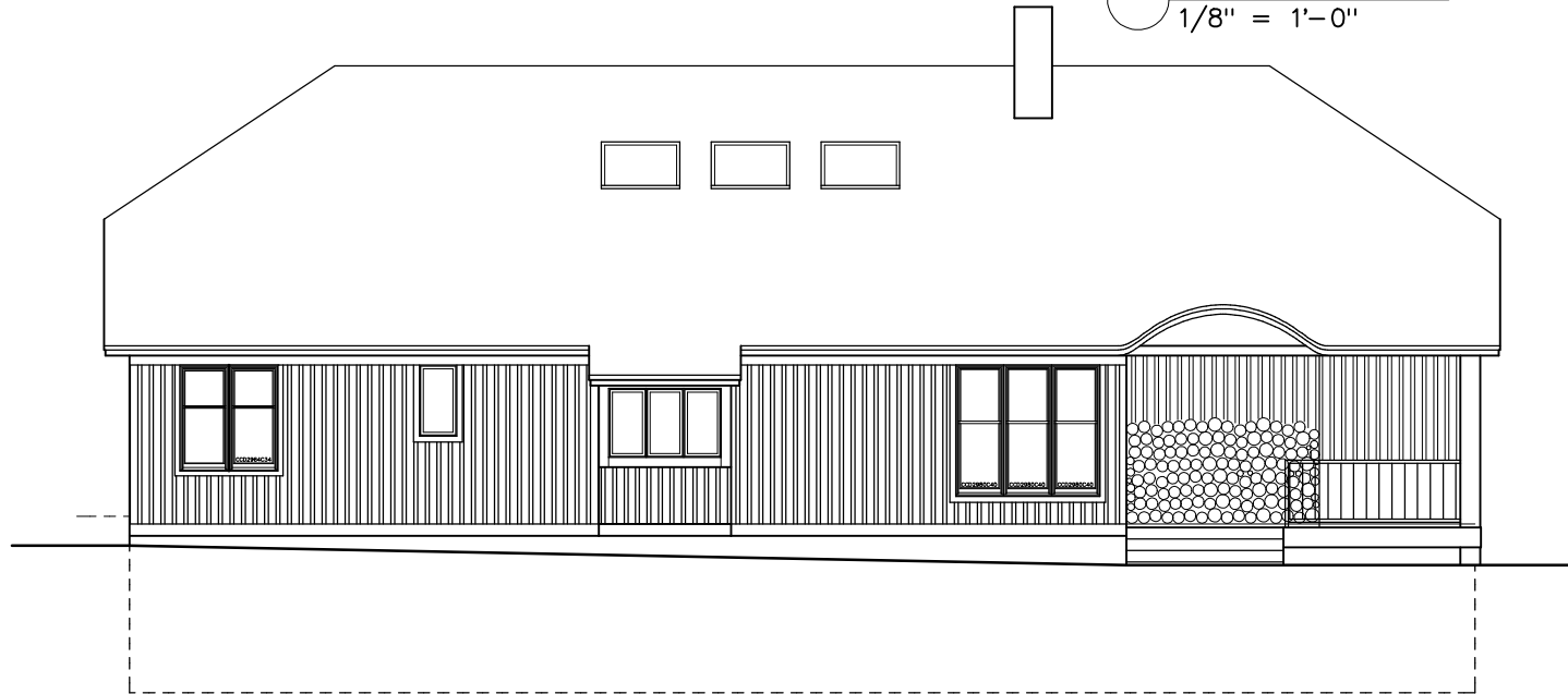
EAST ELEVATION 1/8" = 1'-0"